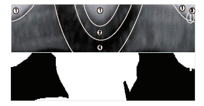
Fig. 1 . Normalized iris image and its corresponding mask. Note that there are many types of noises which contaminate the iris texture, including (1) eyelids (2) eyelashes (3) specular reflections and (4) shadows, and all of them have to be masked out.

We propose a probabilistic, learning-based approach that can learn the distribution of the true iris texture from examples, and is able to estimate very accurate iris masks for un-