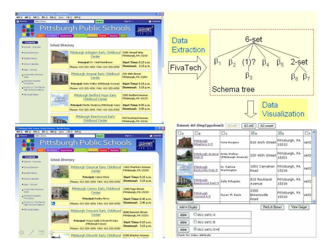
Figure 2. The schema (top-right) of two input pages (left) from PPS web site and spreadsheet-like data visualization (bottomright).

x (for the page schema) into a predefined template. As a result, input pages generated from the same program are similar in appearance, making detection of template and schema possible. Generally speaking, templates, as a common model for all pages, occur quite fixed as opposed to data values which vary across pages. Finding that common template usually requires multiple pages (e.g. RoadRunner) or a single page containing multiple records (e.g. IEPAD) as input. There have been many researches on unsupervised data extraction since then, especially for search result records (e.g. DEPTA, ViPER, WSE). Meanwhile, alternative researches on page-level extraction can also be found (e.g. RoadRunner, EXALG, FiVaTech). The comparison of the various approaches can be found in [2]. In this paper, we have adopted FiVaTech [3] as the data extraction module. Given any number of pages as input, the output of FiVaTech is a schema file and one XML file containing the extracted data for the pages.